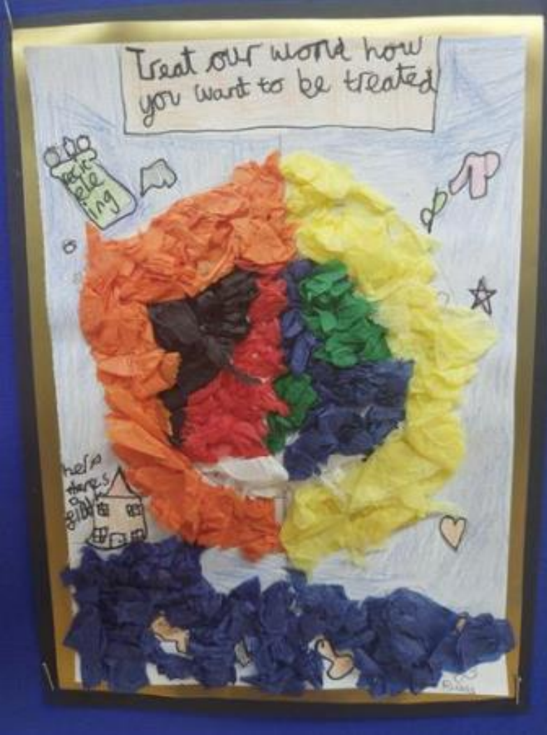
Spirited Arts competition – exhibition for parents/ community