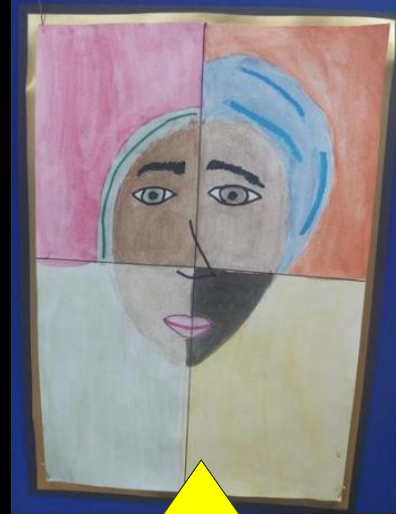
Sharing with the wider community