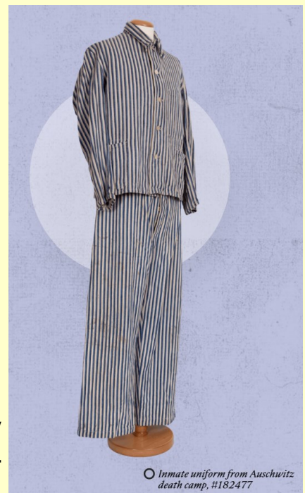
○ Inmate uniform from Auschwitz death camp, H182477

This unprecedented project has been embarked on by the Holocaust Memorial Day Trust (HMDT) – the charity established by the UK government to promote and support Holocaust Memorial Day in the UK, and The National Holocaust Centre and Museum. OOEJ - Homepage - Ordinary Objects, Extraordinary Journeys